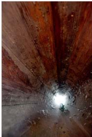
Inside a wooden pipe, which is bound with a coil of metal.