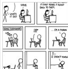
When Pixels Find New Life on Real Paper