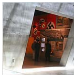
New Looks at the Fields of Death for Jews