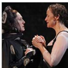
Must I Remind Your Majesty, Two's a Crowd?