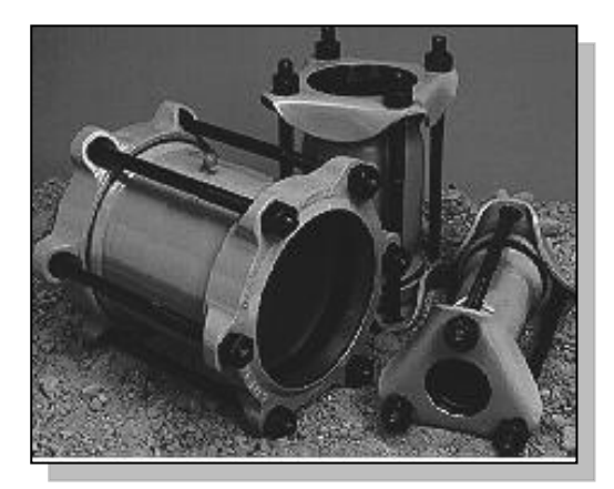
Figure 1a – Steel body, bolt together coupling

The tightening of the bolts brings together internal gripping rings and a sealing element. As the bolts are tightened, the outer ring, commonly called the retaining ring, forces the gripping mechanism or ring and sealing gasket into a state of compression onto the polyethylene, thus creating restraint and a gas tight seal. The tightening of nuts and bolts is to a specified torque value prescribed by the manufacturer's installation instructions.