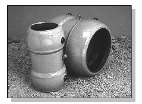
Figure 4 – Hydraulic style coupling

This type of joining method is no longer commonly used on polyethylene, however because there may exist product in the operator's system we review the technology here. This type of coupling involves a steel body product with two hydraulic port holes. Internally, there are gripping plates and seals that are forced onto the piping via hydraulic fluid pressure. Use of this fitting requires that the operator use and maintain a hydraulic pump. The hydraulic hose is attached to the fitting body and hydraulic fluid is pumped into the fitting body thus forcing the gripper and sealing mechanisms onto the pipe. Fluid pressure is measured on a pressure gauge attached to the pump. Installation pressure is predetermined by the manufacturer and detailed in the installation instructions.