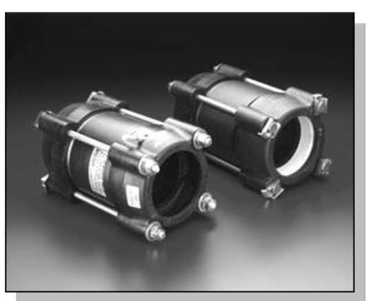
Figure 1b – Plastic body, bolt together coupling